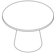
HEP-02 Large work table