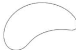
Inno@Audi Model B. Size 25 X 59 cm.