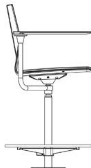
Extra height with footring.