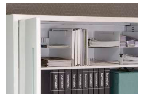
Pigeon Hole Shelf Suitable for traditional pigeon holes for internal mail or storing A4 and A5 forms or literature.