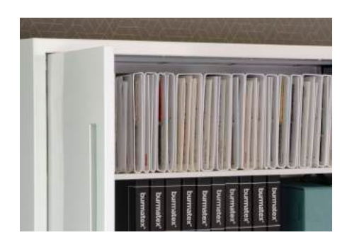
Plain Shelf Ideal for storing Lever Arch Files, boxes and miscellaneous items.