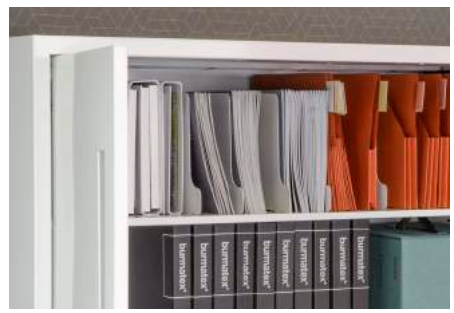
Slotted Shelf For use with dividers, a slotted shelf is useful for items that lack rigidity such as magazines, shelf files and wallets.