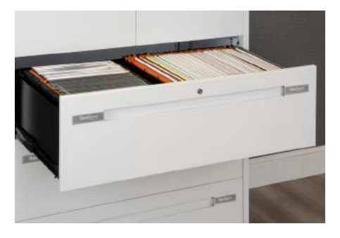
Front-to-Back Filing Suitable for drawers only, allows for suspending files front-to-back in 2 rows.