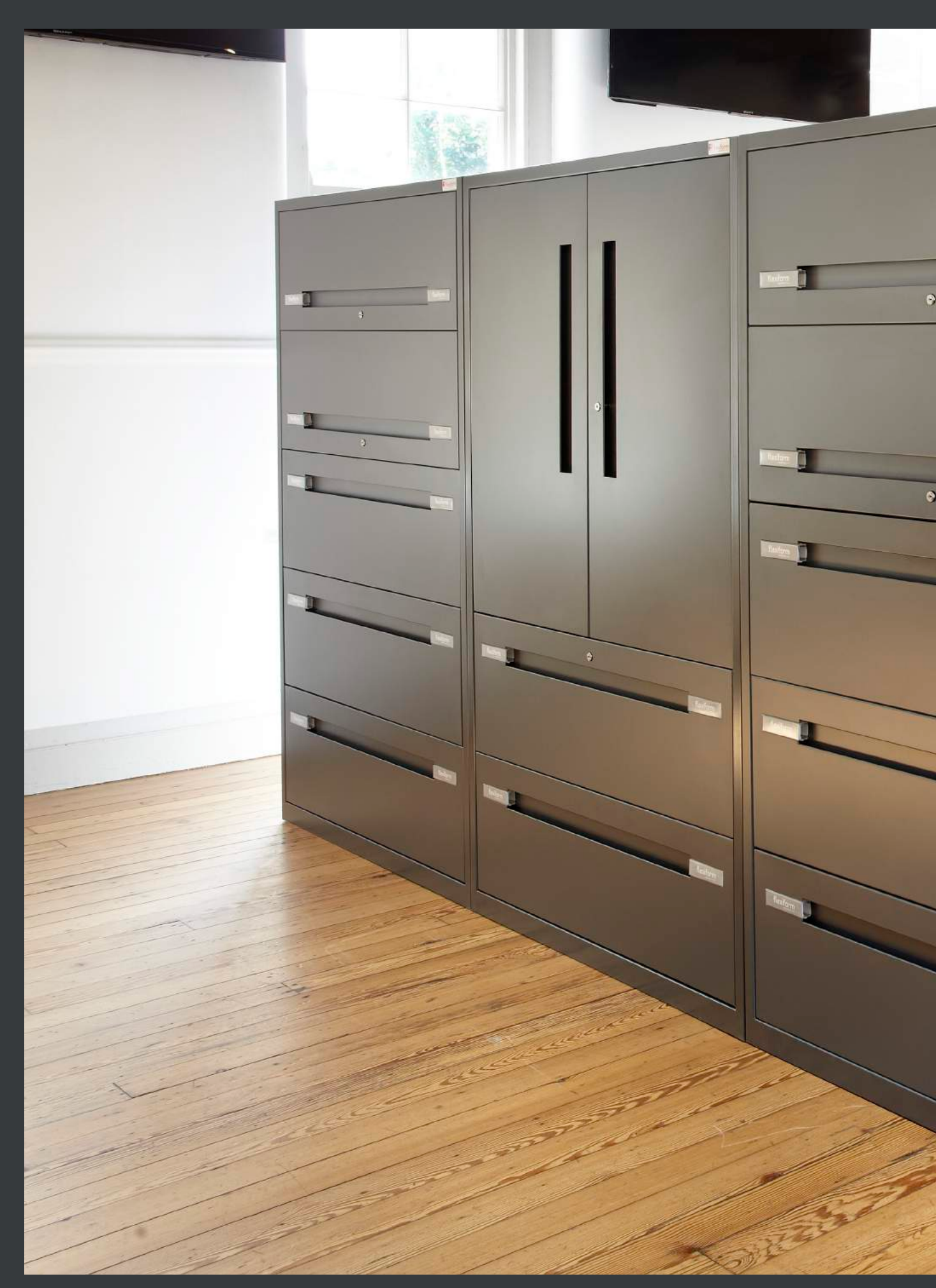
Jot Hiinged door and Side Filer Combination Unit Jot Flipper and Side Filer Combination Unit