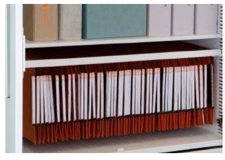
Lateral Suspended Filing Rails For fixed side-to-side suspension files.