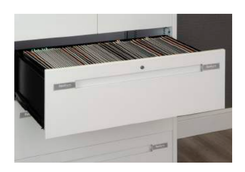
Side-to-Side Filing Suitable for drawers only, allows for suspending files side-to-side.