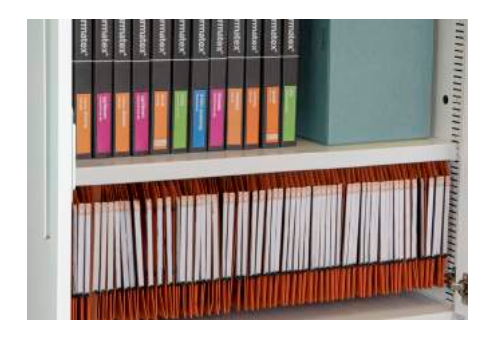
Lateral Plain Shelf with Fixed Rail This shelf stores items like a traditional plain shelf, but can also store suspension files on the rail under the shelf, providing greater flexibility.