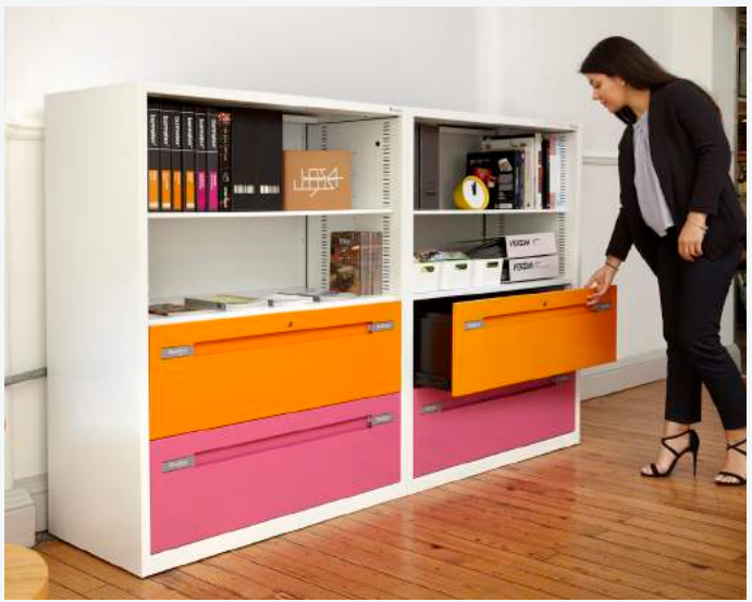
Top Image: Jot Combination storage with flipper and side filer compartments. Bottom Image: Jot Combination bookcase storage with 2 drawers and shelf.